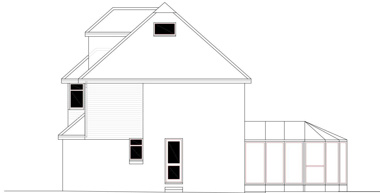
EXISTING SIDE ELEVATION 1:100 @ A3

IF IN DOUBT - ASK COPYRIGHT AZTECH ARCHITECTURE LTD RESPONSIBILITY IS NOT ACCEPTED FOR ERRORS MADE BY OTHERS IN SCALING FROM THIS DRAWING ALL DIMENSIONS, LEVELS AND ANGLES TO BE CHECKED ON SITE BY CONTRACTOR ALL BOUNDARIES ARE ASSUMED AND WE ACCEPT NO LIABILITY FOR BOUNDARY INACCURACY YOU ARE REMINDED OF YOUR RESPONSIBILITIES UNDER THE PARTY WALL ETC. ACT 1996 WHERE APPLICABLE