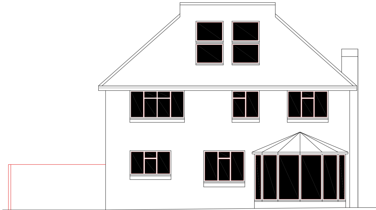
EXISTING REAR ELEVATION 1:100 @ A3