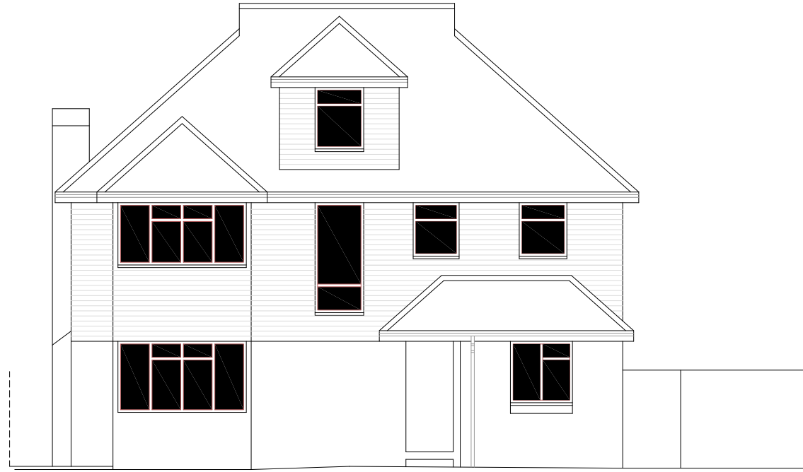
EXISTING FRONT ELEVATION 1:100 @ A3